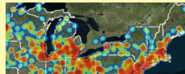
Locations of human trafficking situations in 2019 obtained from National Human Trafficking Hotline Statistics show Michigan as a hot spot.

The National Human Trafficking Hotline: Call: 1-888-373-7888 or Text: "BeFree"